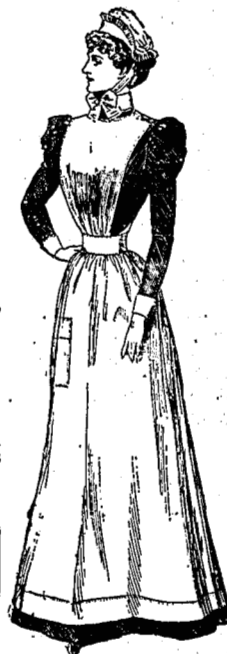
The "Rena" Apron. Made of linen finished Cloth lock-stitch throughout, 2/6 each. In two sizes, 36 in. & 39 in. from waist to hem.