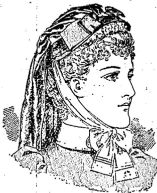
The "St. Bride's" Bonnet. Made of fine Straw with Lace and ruching, and trimmed with Ribbon, and long Silk Gossamer Fall. In black and colours, 12/6 each. Without Fall, 9/6; also The "St. Clare" Bonnet. 6/11 complete.